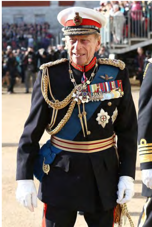
Prince Philip served as Captain-General of the Royal Marines for 64 years from 1953 to 2017

As an aside, Club Membership records describe Prince Philip's occupation as "retired" and address as "Buckingham Palace, London".