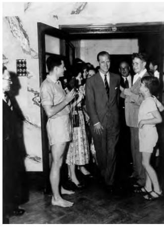
Prince Philip in Brisbane, 1954

The life membership was a way of formally recognising Prince Philip's visit to Brisbane, if not to the Club. The committee meeting following the Royal Visit read letters of thanks from members of the Royal Tour party who had been given honorary membership while in Brisbane.